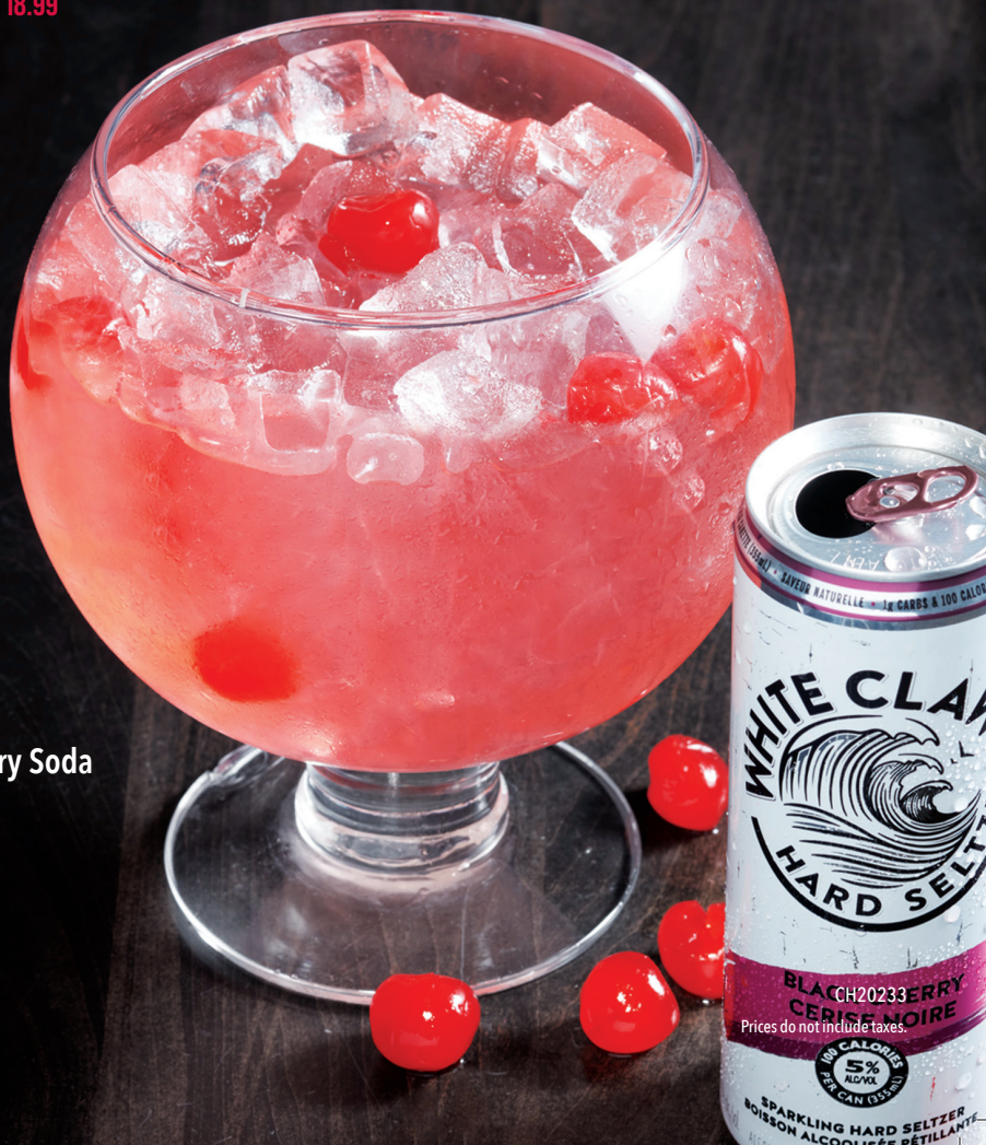
Black Cherry Soda

Captain Morgan's Spiced Rum, pineapple, mango and citrus fruit juices. Topped with soda and Red Bull Tropical. (2 oz+250 ml) | 18.99