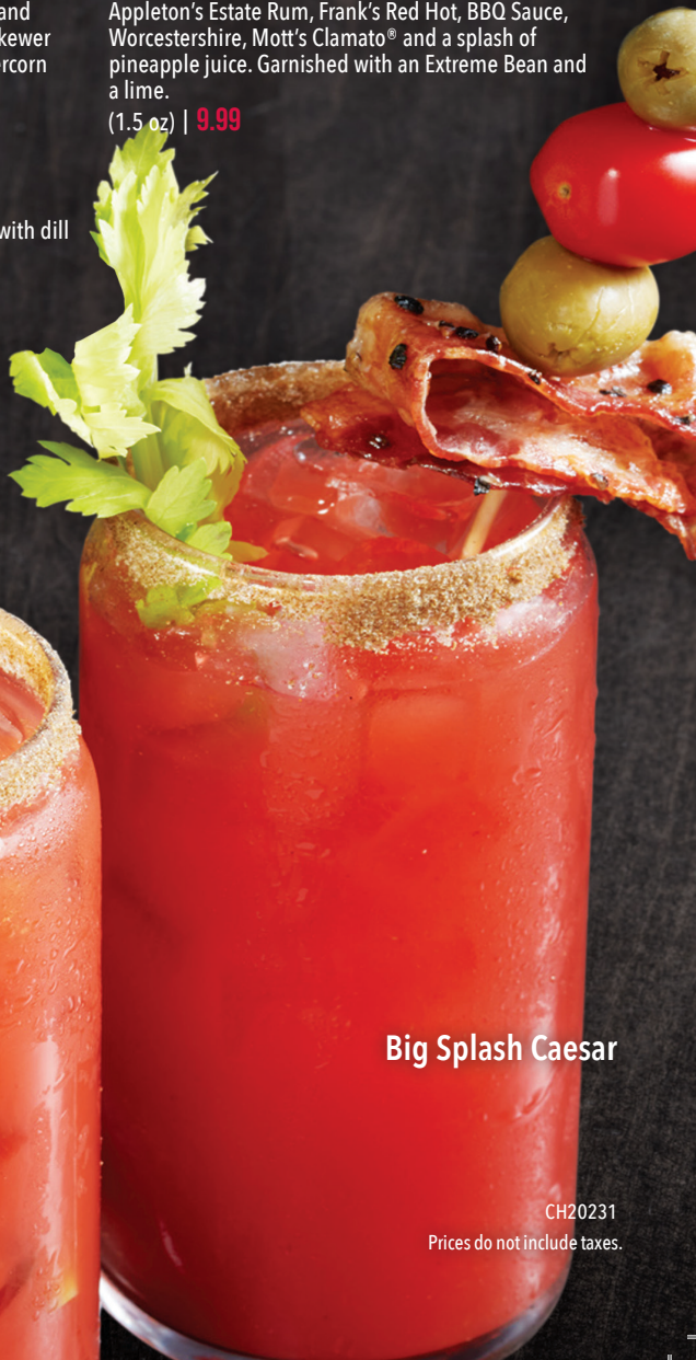
Big Splash Caesar