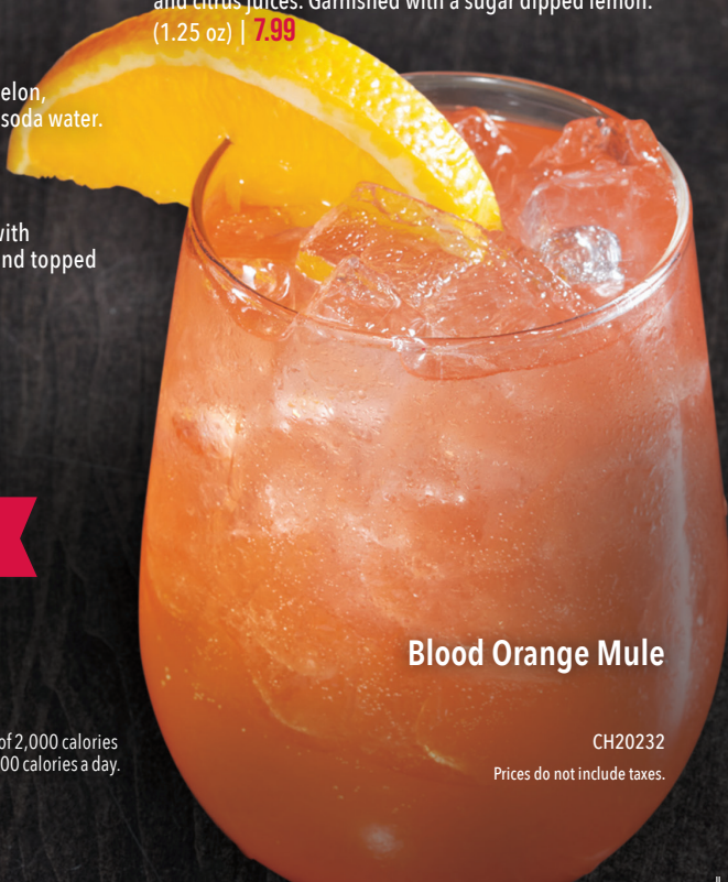
Blood Orange Mule