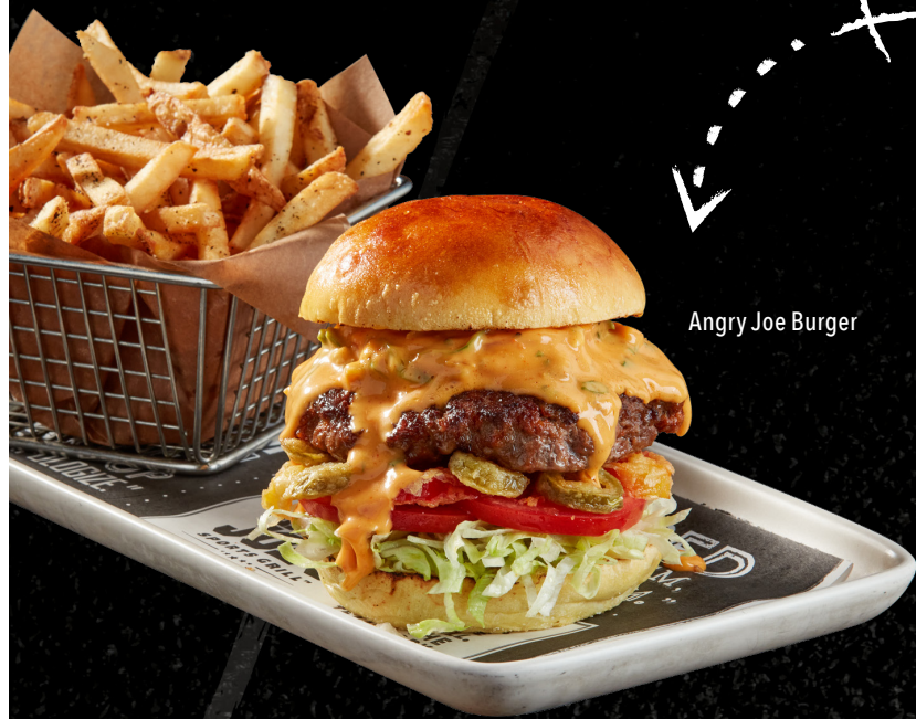
Angry Joe Burger

Choice of Fries or Field of Greens: Lemon Herb / 180 Cals, Balsamic / 170 Cals, Blue Cheese / 300 Cals, Ranch / 210 Cals, Cilantro Pepita / 260 Cals. Upgrade Regular Fries to Supreme Cheese Fries, Garlic Dill Pickle Fries or Classic Poutine for $5. Gluten-friendly buns available on request.