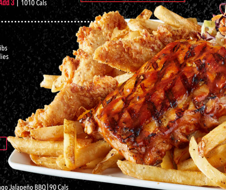
Joe's Baby Back Ribs with Chicken Tendies