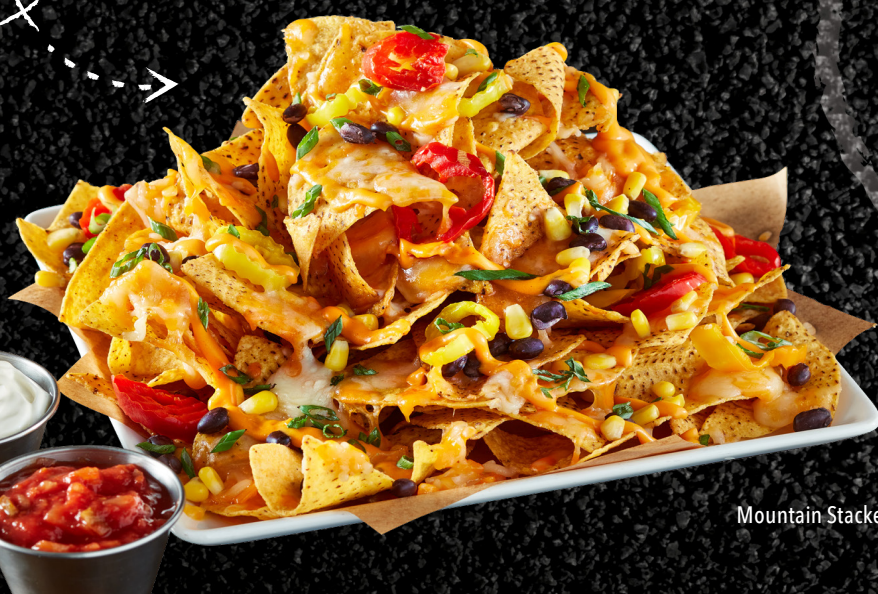
Mountain Stacked Nachos

Crispy Boursin cheese, strawberries, candied almonds, pickled onions, romaine lettuce, arugula, basil, balsamic dressing, balsamic glaze. 19 | 690 Cals